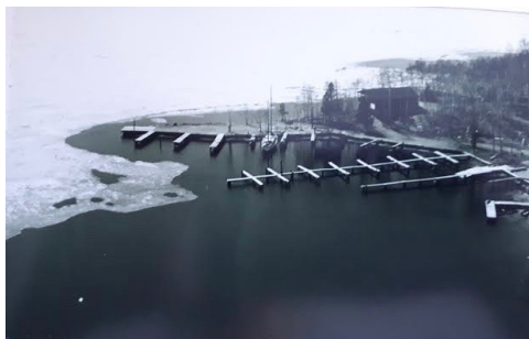
This is an aerial shot of the Club in 1973, the year after the clubhouse was built. Note the layout of the harbour.

Following are more photos from the NBYC photo albums.