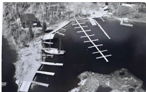
Here is another aerial shot taken at the same time. A wooden launch ramp is just to the right of the long pier.