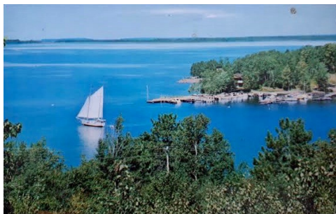
A boat owned by Harvey Charter leaves the bay. It is a 40 ft. Ferrocement boat and weighed about 13 tons. circa 1975