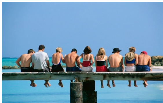
Are these NBYC members waiting for the water to rise?