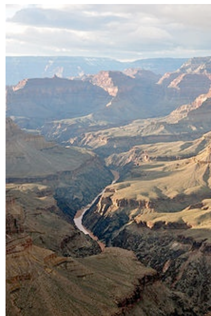
This could be the French River in 2010.